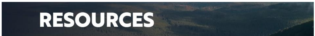
Figure 4 Resources page (guidelines, infopacks, best practices, etc)